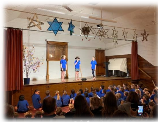
Photos from 2021 Matariki performance