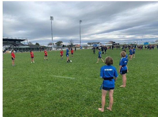
Photos from 2021 Rippa Rugby Tournament