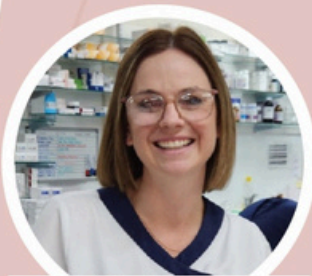
Tash Clemens Temuka Pharmacy